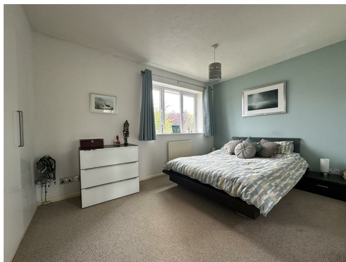
Bedroom One 12'09 x 8'10" (3.89m x 2.69m)

Double glazed window to the rear, radiator, built in wardrobe and door to the en suite.