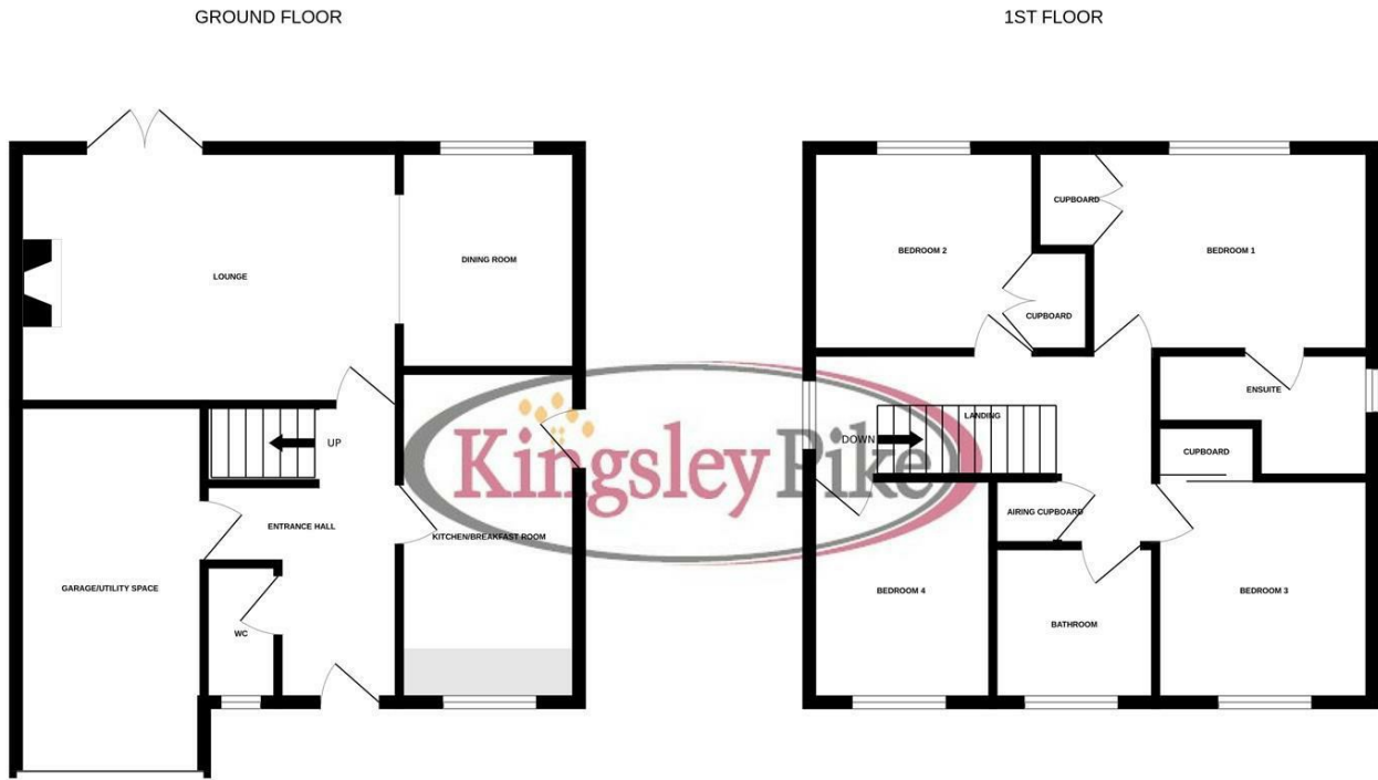
4 BEDROOM DETACHED HOUSE

Whilst every attempt has been made to ensure the accuracy of the floorplan contained here, measurements of doors, windows, rooms and any other items are approximate and no responsibility is taken for any error, omission or mis-statement. This plan is for illustrative purposes only and should be used as such by any prospective purchaser. The services, systems and appliances shown have not been tested and no guarantee as to their operability or efficiency can be given. Made with Metropix ©2025